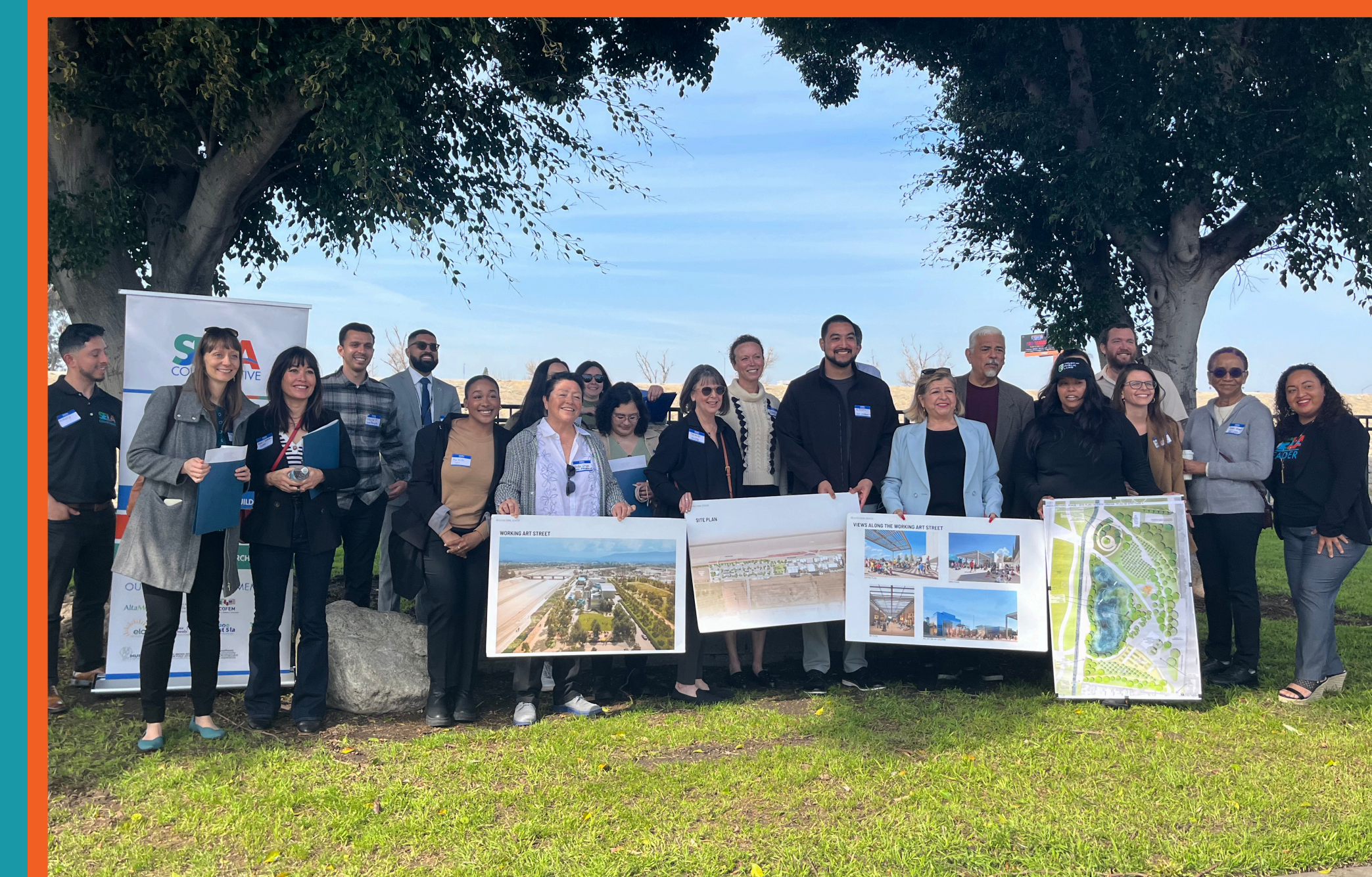
From left to right: 1) Presenting the GCRCC to SELA city staff and local elected officials; 2) Los Angeles River community cleanup event hosted by SELA Collaborative; 3) Strategic Growth Council Site Visit 2024